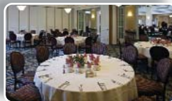
Abbott Center Dining Room